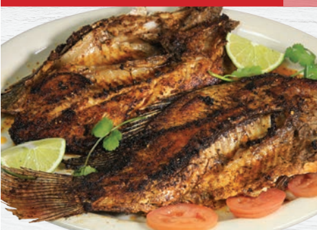
MOJARRA A LA PLANCHA