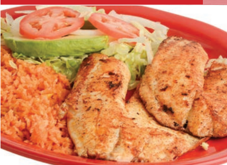
FILETE DE PESCADO A LA PLANCHA