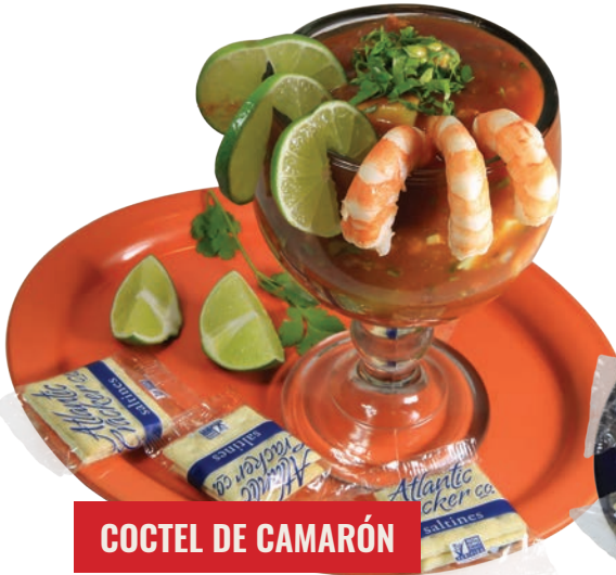
COCTEL DE CAMARÓN