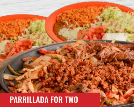
PARRILLADA FOR TWO

Prepared with rib-eye steak, chicken, shrimp, braised pork, Mexican chorizo, grilled cactus, onions, roasted jalapeños. Served with rice, beans, lettuce, sour cream, guacamole & tortillas $54.99