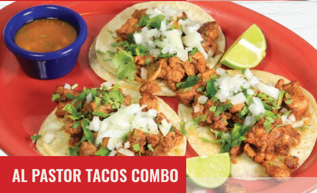
AL PASTOR TACOS COMBO