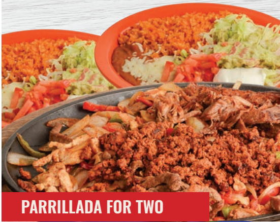
PARRILLADA FOR TWO