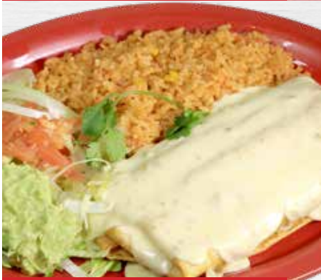
LOBSTER SEAFOOD CHIMICHANGA