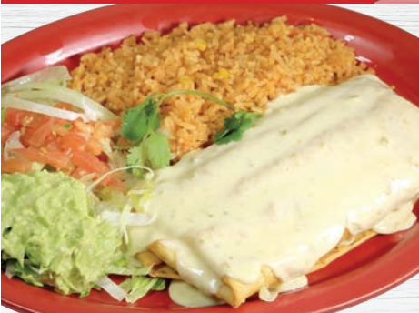
LOBSTER SEAFOOD CHIMICHANGA