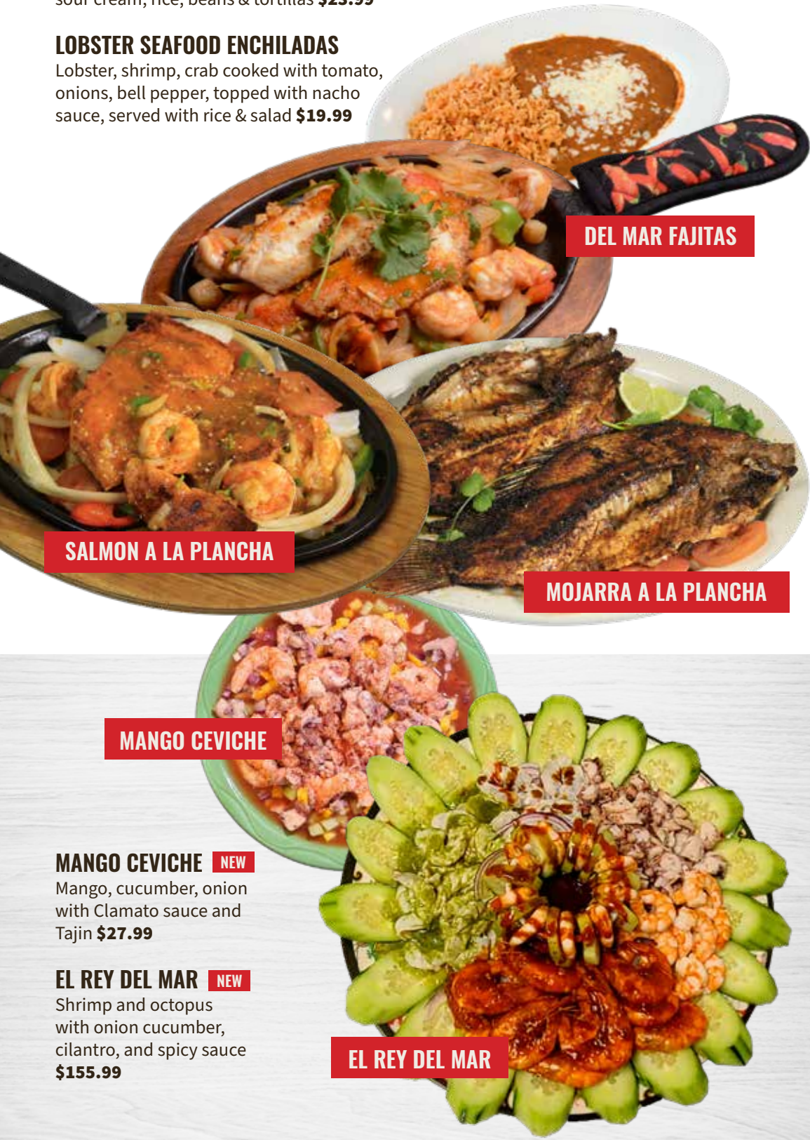
SALMON A LA PLANCHA