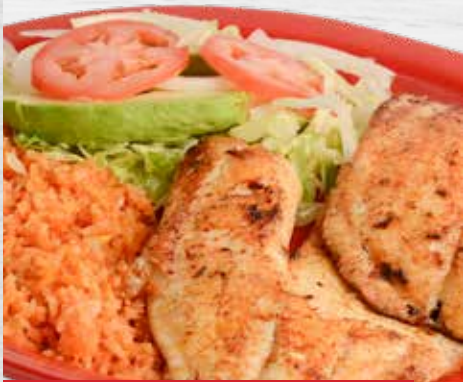
FILETE DE PESCADO A LA PLANCHA