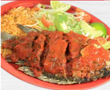
MOJARRA A LA DIABLA