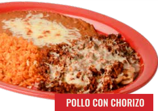
POLLO CON CHORIZO

Chicken breast with Mexican sausage & cheese, served with rice, beans & tortillas $17.99