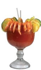
Michelada Special with Shrimp