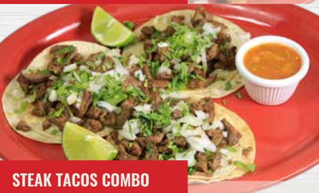
STEAK TACOS COMBO