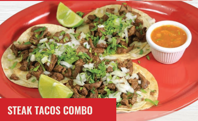
STEAK TACOS COMBO