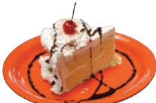
Tres Leches Cake