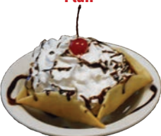
Fried Ice Cream