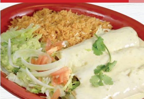
LOBSTER SEAFOOD ENCHILADAS