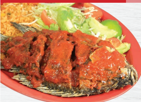
MOJARRA A LA DIABLA