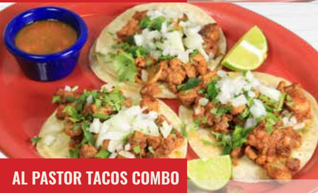
AL PASTOR TACOS COMBO