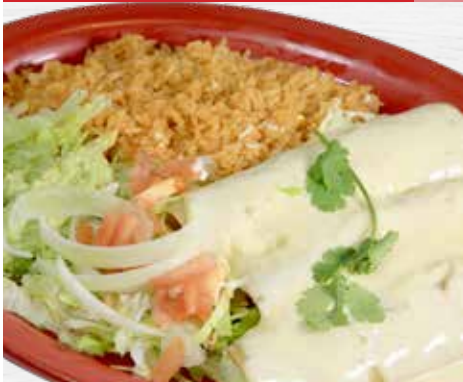
LOBSTER SEAFOOD ENCHILADAS