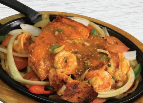
SALMON A LA PLANCHA

Tender shrimp sautéed with onions, bell pepper & tomatoes. Served with guacamole salad $15.99