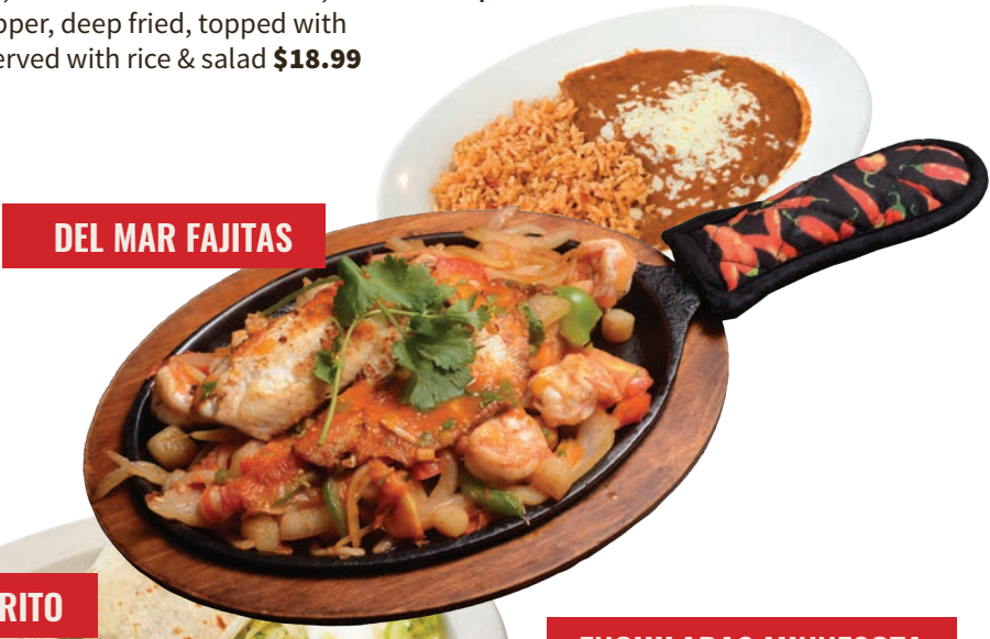
DEL MAR FAJITAS