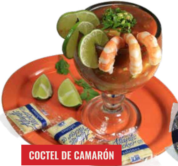
COCTEL DE CAMARÓN